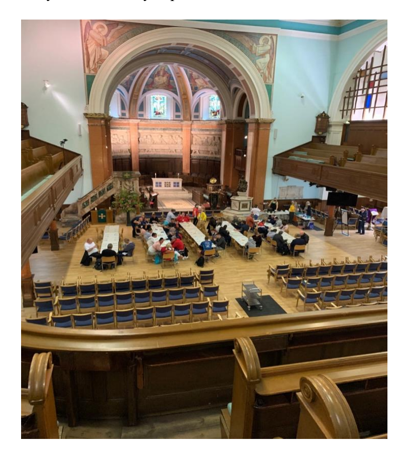
The sanctuary at St Cuthbert's set up each Sunday evening to serve our homeless guests, note the life size alabaster replica of Leonardo's "Last Supper" in the apse.

giving orders which come by virtue of my privileged position. Moving from Martha to being more like Mary came with my experience in lockdown.