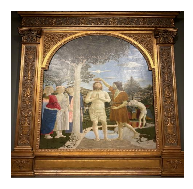
"The Baptism of Christ," 1437, Pierro della Francesca.

They would have felt they belonged to this story and that they were with Christ at his baptism as they gazed on Piero's painting.